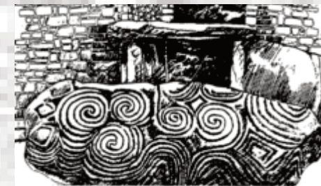
Newgrange Passage Grave - O'Broin